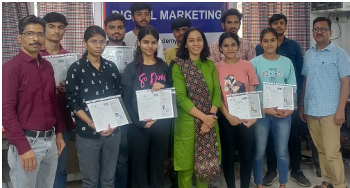
Closing Ceremony and Certificate Distribution for the first Batch of digital marketing training program in presence of our funding partner Angel One CSR team. Most of them are now working in the same field.