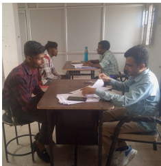
Mock Interview session for the participants of Placement Readiness Program in Banswara as a part of curriculum to prepare them to face real interviews from companies