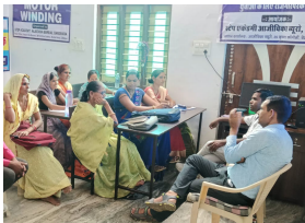
Interaction with Yuva Mitra Cadre in Banswara regarding updates from the community along with refreshing their skills on youth counselling along with brainstorming new and creative ways to interact with youths from their community and link them to skilling opportunities provided by STEP