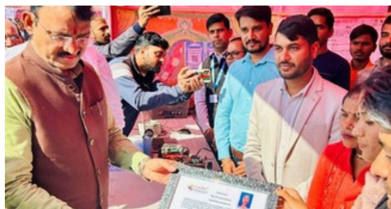
Deputy CM Champions Women's Empowerment

women, enabling them to secure spacs at the Gram Panchayat level. By becoming E-Mitra Operators, these women are now empowered to support their families financially while bridging the digital gap in rural areas. This initiative highlights the impact of skill-based training in creating sustainable livelihoods and fostering women's entrepreneurship at the grassroots level.